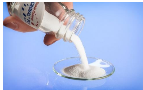
Micronal 5528 X Dry powder

In addition to using Micronal in PU systems, favorable results can also be achieved in thermoplastic applications like PP, PE, POM, EVA, and TPU used in injection molding and extrusion processes.